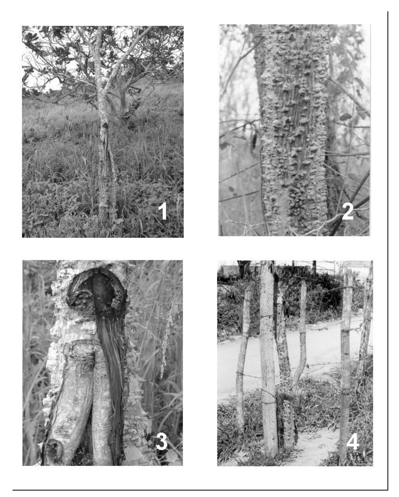
Figure 1 Anadenanthera colubrina (Vell.) Brenan. Caption: 1. General aspect of the species; 2. Detail of the trunk bark; 3. Detail of the bark during regeneration; 4. Use for fences.