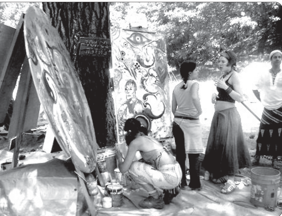
Visual artists, as well as musicians and dancers, are celebrated and supported at dance collectives events.

For MAPS members whose primary associations with psychedelic culture are The Oracle or Woodstock, these communities should serve as welcome successors to the dreams of older generations. They have taken the ideals of peaceful activism, spiritual growth, and personal freedom and brought them into a 21 st century context. In sharing MAPS’ research and educational work at these events, we also had the chance to connect to our own community — a psychedelic culture which is alive and well. ■