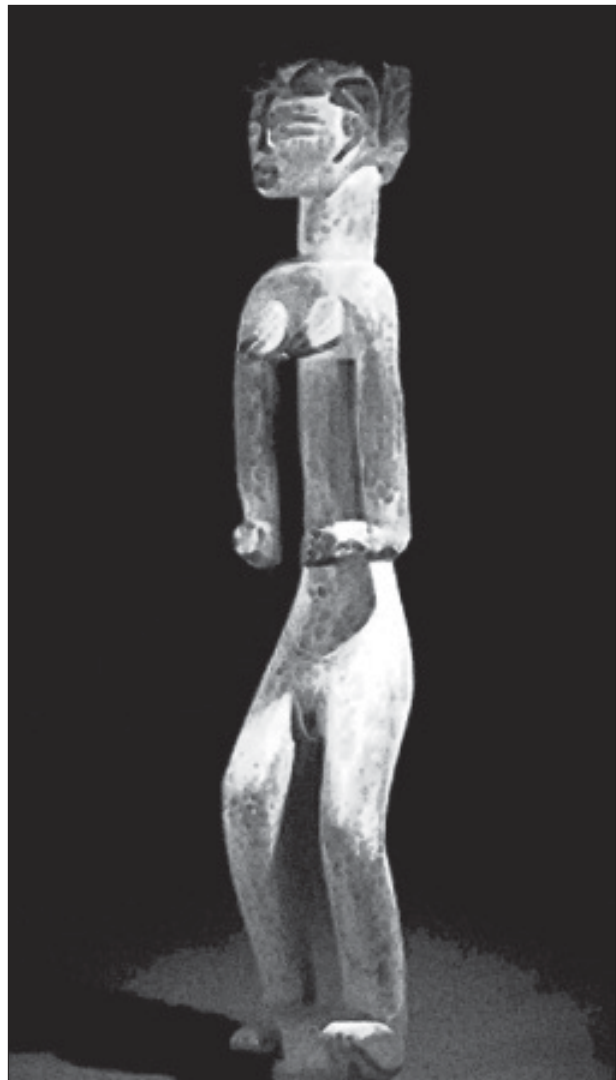
Tsogo people, Gabon Female Figure from a Bwiti Shrine, 20th century Wood, nails 135.9 x 24.1 x 24.1 cm.

To subscribe, send email (with any subject) to ibogaine-subscribe@mindvox.com or visit http://www.ibogaine.org . ■