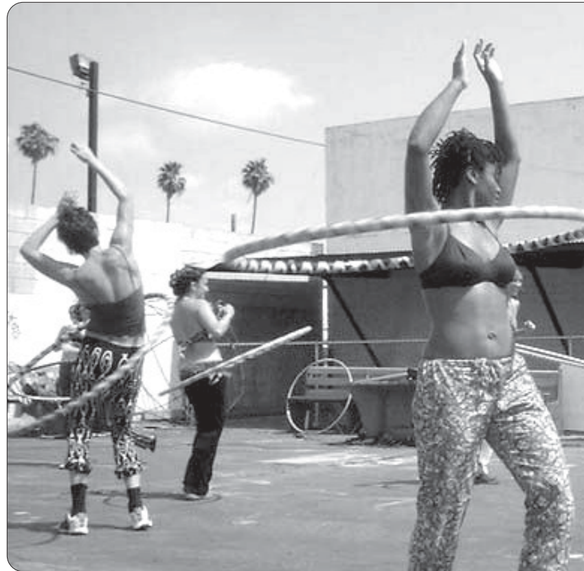
Hoopers practice their skills at the Gathering of the Tribes