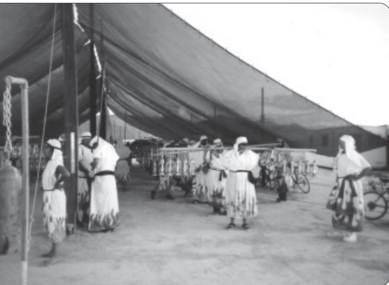
Lamplighters prepare to illuminate Black Rock City

I have to admit I was a little disappointed that I personally didn't have the chance to work with anyone in a profound psychedelic state. I had a fantastic conversation with a dehydrated woman, sat with a drunken pilot who mistakenly