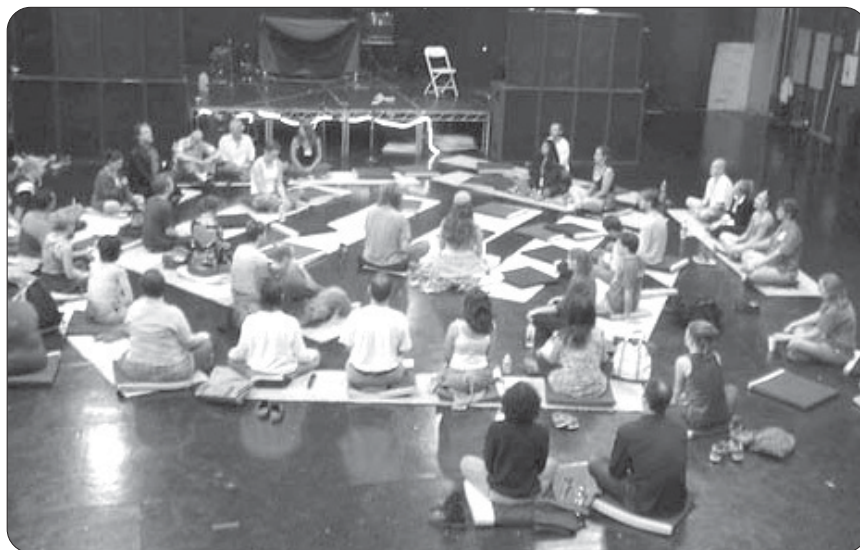
GOTT participants sit on pillows, mats and other soft things during the opening meditation.