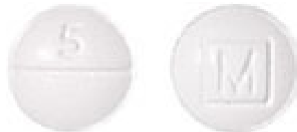
Photo 17 - Oxycodone