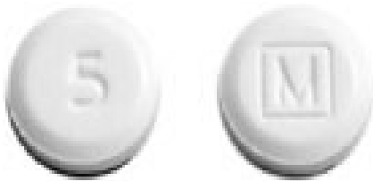
Photo 16 - Methylphenidate